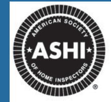
American Society of Home Inspectors

Licensed in the State of Illinois and Indiana, insured and bonded